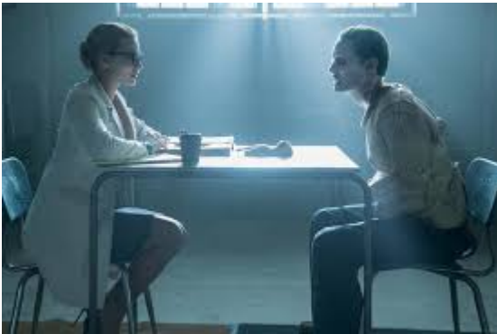
Harleen Quinzel and Joker in the Suicide Squad Movie

comics and didn't show the extent of how the relationship really is. In Suicide Squad (the movie) Joker keeps trying to rescue Harley out of the prison and get back his "love" when (as I have pointed out) in the comics he has tried to kill her, left her for dead (like in the movie in the drowning car), and insulted her. Joker probably would not have gone to these lengths in the comics or gone crazy about it, he probably would have left her there.