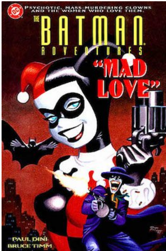
The Batman Adventures: Mad Love

She captured the minds and hearts alike of her fans with her broken appearance and how she was Joker's love. In a later addition, she made an appearance in a comic named The Batman Adventure's: Mad Love in 1994, showcasing how she was Joker's therapist (like in the movie) turned co-conspirator.