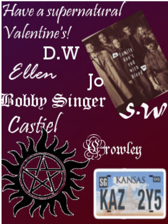
A Supernatural Valentine :)