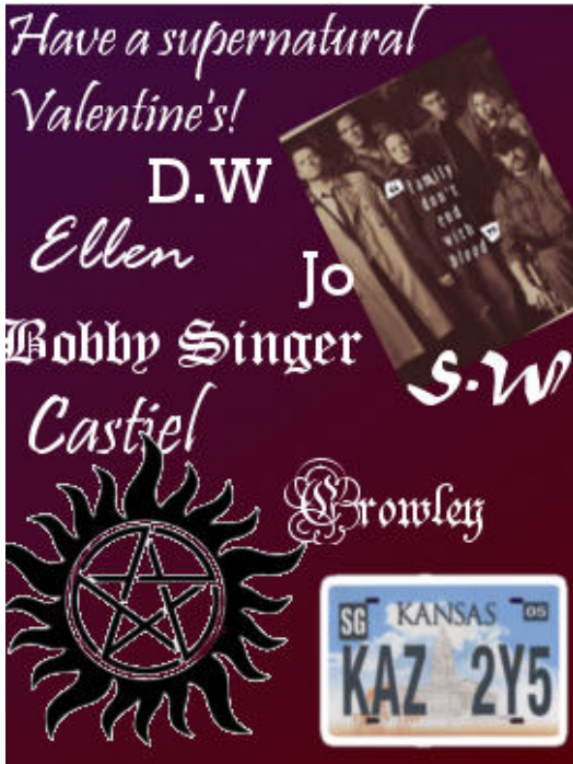
A Supernatural Valentine :)